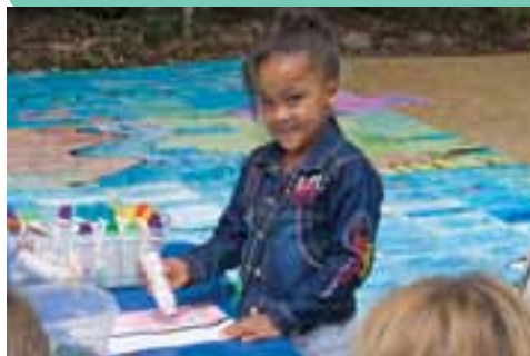
DIGY070905_2099.tif Young artist takes part in collaborative marine mosaic on the 2005 West Coast Tour.