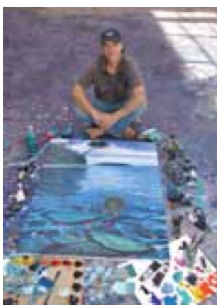
DIG20m012306_0109.tif Wyland Painting "Two Worlds of Paradise".