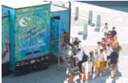
DIGG1010f7_3282.tif Students line up to explore the Wyland Clean Water Mobile Learning Center in Baltimore, MD —Oct. 2007.