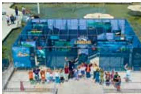
DIG0701f5_0170.tif Wyland and kids celebrate at the Water's Extreme Journey Maze.