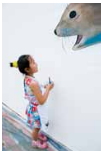
Digg0714f8_7355.tif Student studies Wyland's Mediterranean Monk Seal for "Hands Across the Ocean" Beijing, China - July 2008.