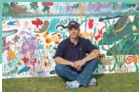
DIG1008f6_499.tif Wyland at the National Mississippi River Museum and Aquarium in Dubuque, IA on the 2006 Barging down the Mississippi River Tour.