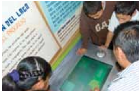
DIGG1119b8_0114.tif Students explore the Wyland Clean Water Mobile Learning Center in Tijuana, Mexico — Nov. 2008.