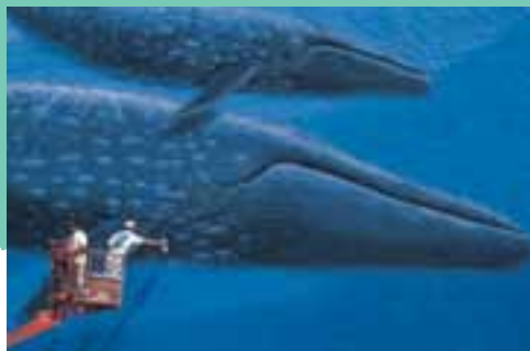
PaintingBlueWhales.eps Painting the world's largest mammal - a blue whale and her calf in Hollywood, CA for Whaling Wall 63.