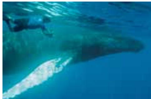
DIG030805_1911.tif Free diving with humpback whales near the Silver Bank, Dominican Republic