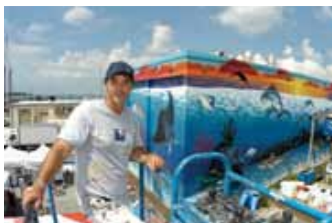
DIG092703_53ww52.tif Wyland and Whaling Wall 52 in Key West, FL.