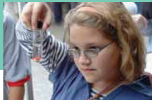
DIG1018f6_0356.tif Water quality education on the 2006 Barging Down the Mississippi Tour.