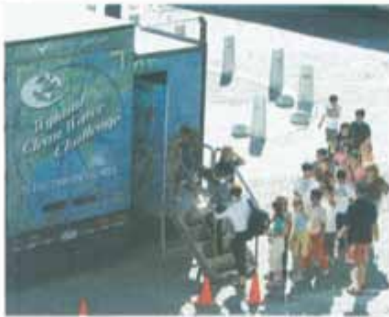
Kids line up outside the National Aquarium in Baltimore to learn about the importance of keeping our water supply clean. Below, Upper Marlboro's Tremon Bailey looks at the wetlands exhibit.