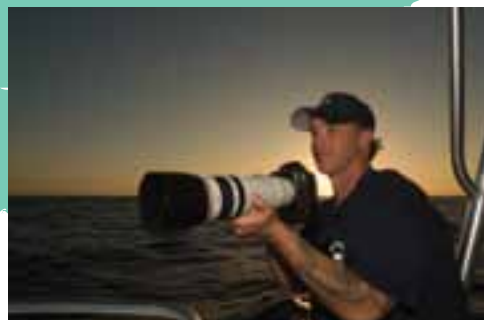
DIG 030805_1890.tif Wyland on a photographic expedition in the Sea of Cortez.