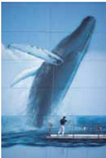
C29504_222.tif The artist painting a breaching humpback whale in Honolulu, Hawaii for Whaling Wall 6.