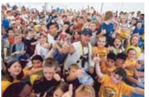
101304_02xx88Rprint.tif Wyland and young artists in Destin, FL.