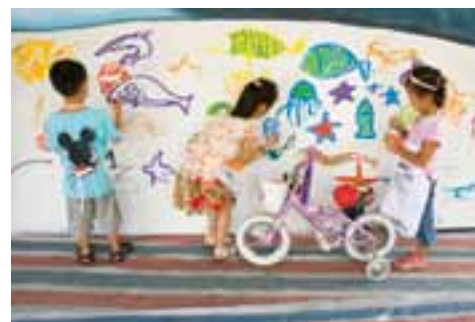
Digg0716f8_8848.tif Young Artists take part in "Hands Across the Ocean" in Beijing, China - July 2008.