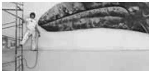
C26041_001.tif Taking a break from creating his first mural in Laguna Beach - 1981.