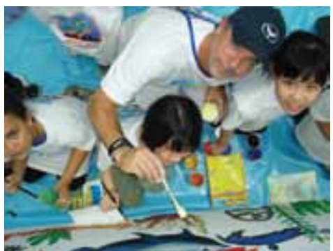
DIG14mb072504_0182.tif Wyland paints with young artists on the 2004 Wyland Ocean Challenge East Coast Tour.