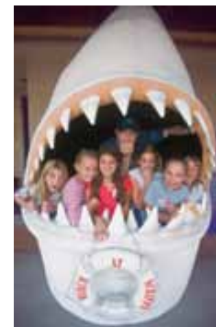
121103_06WOC03_Birch.tif Taking a break with students and the Birch Aquarium during the 11-city 2003 Wyland Ocean Challenge "Underwater Village" tour, co-sponsored by the Scripps Institution of Oceanography (UCSD).