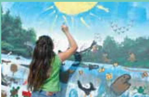
DIG1008f6_0047.tif Adding rays of sunshine to the Mississippi River mural in Dubuque, Iowa - Oct. 2006.