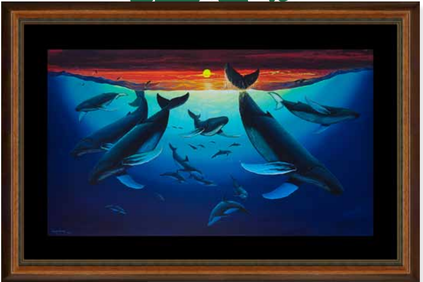
OCEANS Original oil painting by Wyland, inspired by the 2010 Disney nature film, OCEANS .

Since 1978, Wyland Galleries has been the art community's preeminent showcase for the finest in marine life paintings, sculpture and photography. In the spirit of artist Wyland's original vision, Wyland Galleries continues to provide the highest quality fine art, and is considered one of the world's premiere fine art galleries, inspiring art lovers and collectors from over seventy countries. To learn more about Wyland's latest artwork, visit www.wylandgalleries.com or call 800-WYLAND-0.