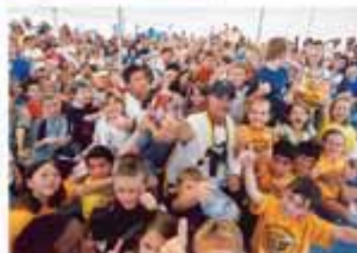
▲ Clockwise from top: Children from more than 250 nations joined Wyland in Beijing last month for the "Hands Across the Oceans" mural project; Wyland celebrates with young artists in Destin, Fla.; Wyland paints with area kids during the 2004 Ocean Challenge East Coast test.

Thanks to Wyland and other artist activists, the movement is gaining momentum within the art community. Artists Romero Britto and Guy Harvey recently joined Wyland in the creation of his 99th Whaling Wall in North Lauderdale, Fla. And, following his appearance at the upcoming Artexpo Las Vegas, Wyland will lead one of the largest-scale artist collaborations of his career—the Artexpo New York Green Challenge. "We're going to breathe some green life into the show," Wyland says. "With so many talented artists uniting and putting their heads together for a cause, we can really do something great."