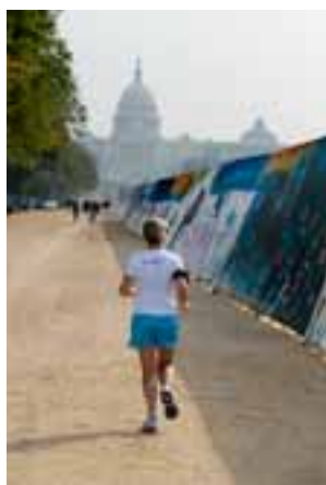
DIGG0930f8_9583.tif Whaling Wall 100 "Hands Across the Oceans" on display at the National Mall in Washington D.C. - Oct. 2008.