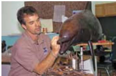
DolphinWelcomeClay_05.eps Sculpting a dolphin at the foundry in Sandy, Oregon.