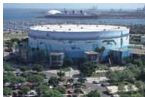
ww33.tif Whaling Wall 33, "Planet Ocean", Long Beach Convention Center, Long Beach, CA. Largest mural in the world, as listed, May 4, 1992, Guinness Book of World Records. 1, 280 ft. in diameter and 105 ft. high.