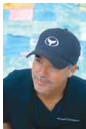
081205_MymosaicWOC05sm.tif Wyland Portrait.