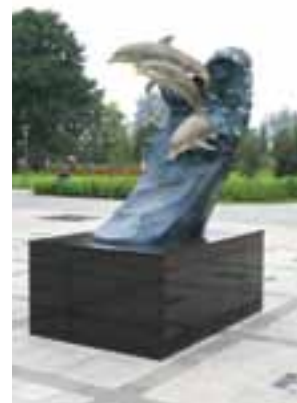
DIGG081308_9109.tif Wyland's Monumental Sculpture "Faster, Higher, Stronger" was unveiled at the International Sculpture Park in Beijing, China for the 2008 Olympics.